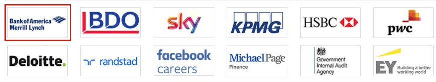
Homepage Featured Employer Button