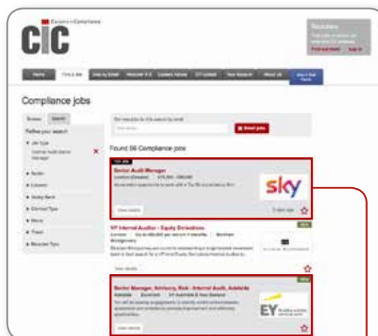
Job of the Week £1,095