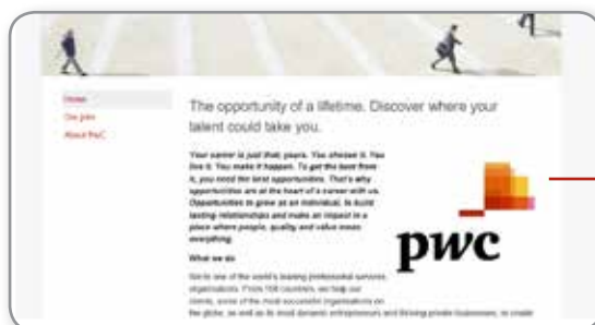
Mini Site £450