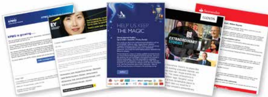
'Compliance Direct' Targeted Email examples

Choose your candidate distribution list from any criteria including job title, salary, location, sector, experience and skills, among many others. We currently have over 140,000 candidates who have subscribed to receive our Targeted Emails. Our response rates are impressive with typical click-through rates of up to 25%. All of these candidates are fully subscribed to hear about third party job offers. All Targeted Emails include proofs, list management, distribution and statistical reporting following each campaign. All emails are fully branded HTML and we can design them for you if required. Contact us for more information.