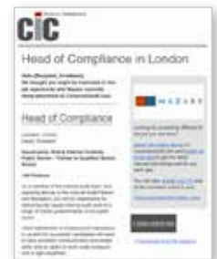
Job Shot example