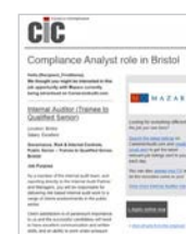
Job Target Email example