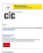
Job Alert example

Choose your candidate distribution list from any criteria including job title, salary, location, sector, experience and skills, among many others. We currently have over 85,000 candidates who have subscribed to receive our Targeted Emails. Our response rates are impressive with typical click-through rates well above the industry average. All of these candidates are fully subscribed to hear about third party job offers. All Targeted Emails include proofs, list management, distribution and statistical reporting following each campaign. All emails are fully branded HTML and we can design them for you if required.