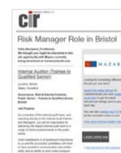
Job Target Email example