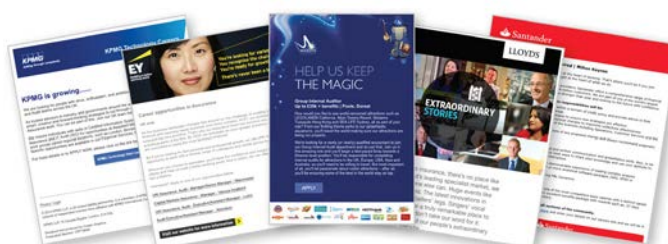
‘Risk Direct’ Targeted Email examples