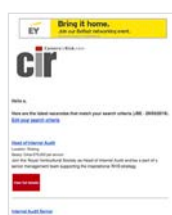
Job Alert example

Choose your candidate distribution list from any criteria including job title, salary, location, sector, experience and skills, among many others. We currently have over 85,000 candidates who have subscribed to receive our Targeted Emails. Our response rates are impressive with typical click-through rates well above the industry average. All of these candidates are fully subscribed to hear about third party job offers. All Targeted Emails include proofs, list management, distribution and statistical reporting following each campaign. All emails are fully branded HTML and we can design them for you if required.